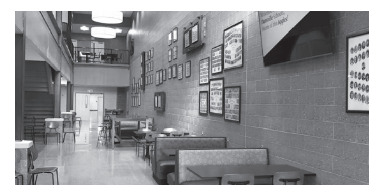
New High School Commons with Restored Composites

We want every student to learn what it means to be an Aggie Achiever, so watch for more as we stretch our Aggies to set high goals and dream big dreams!