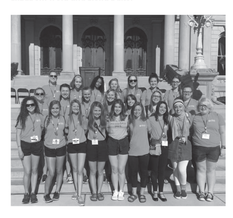
Girls State Participants