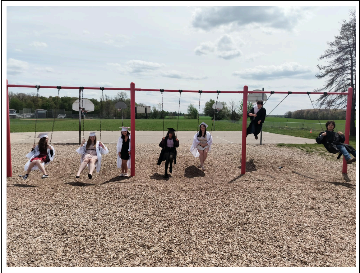
Senior “Skip” Trip: We traveled to Cedar Point with a group of 29 Seniors to celebrate their years here at Dansville and to reward them for not participating in the “Skip Day” tradition of missing school. It was a GREAT time!