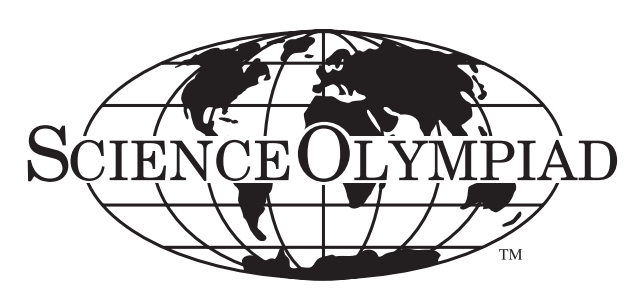
Exploring the World of Science